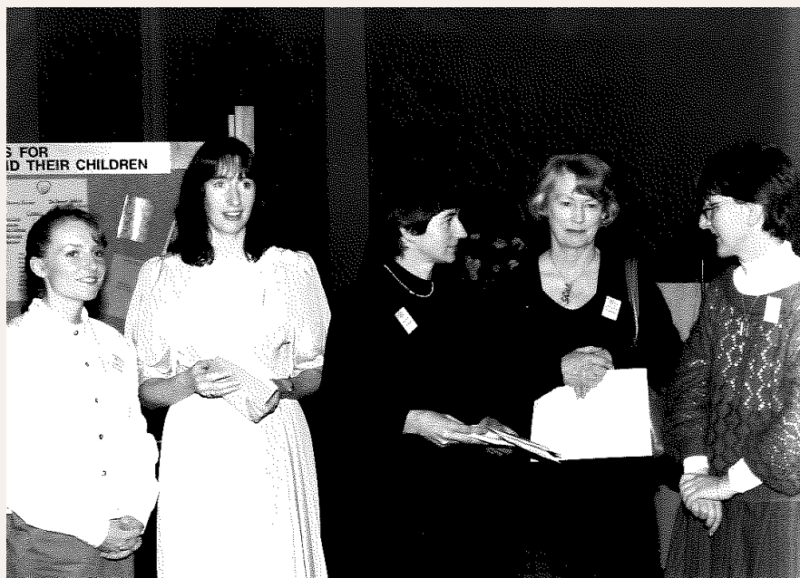
Authors at the Launch of “Mothers Alone?” Report

Treoir also made a submission to the Commission on the Family which resulted in a recommendation for the study being included in the Commission’s final report in 1998. The proposed National Longitudinal Study was raised in meetings in 1999 with the Minister for Social, Community and Family Affairs, Dermot Ahearn and Minister of State at the Department of Health and Children Mary Hanafin.